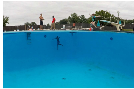
deep end of pool