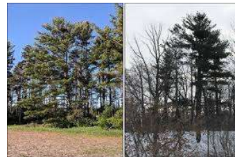
Large nest in a Temperate Forest