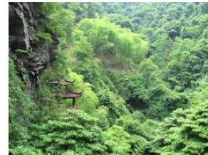
China's Bamboo Forest