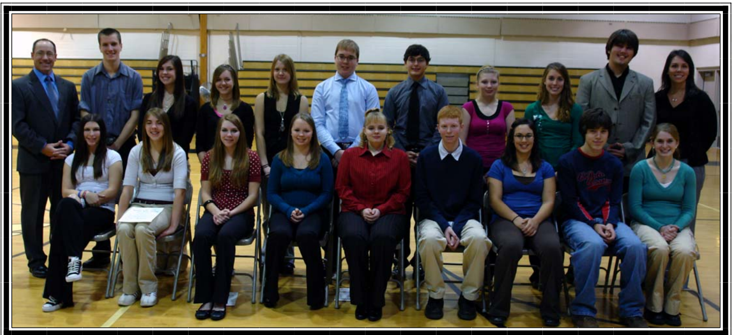
Forestville Central School Honor Society